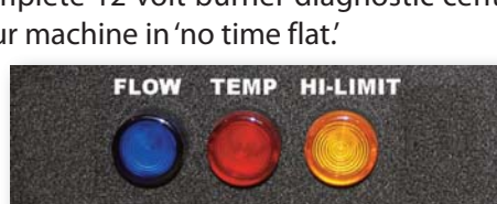
Allison Burner Diagnostic Center

It will tell you in 2 seconds what it would normally take 2 hours to figure out on your own. A very simple wiring job using the enclosed instructions will have you up and running with a complete 12 volt burner diagnostic center on your machine in 'no time flat.'